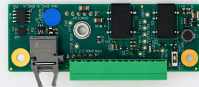
Signal Manager with Master Relay 1200607