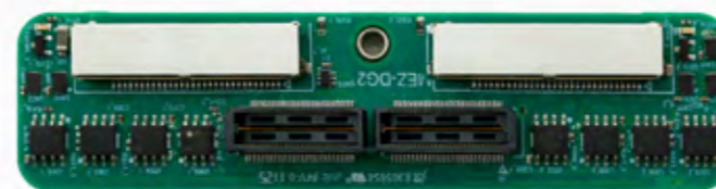
Printhead Card Expansion Board 1200491