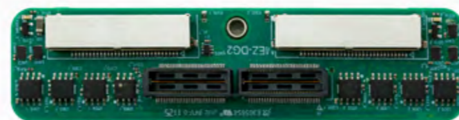
Printhead Card Expansion Board 1200491