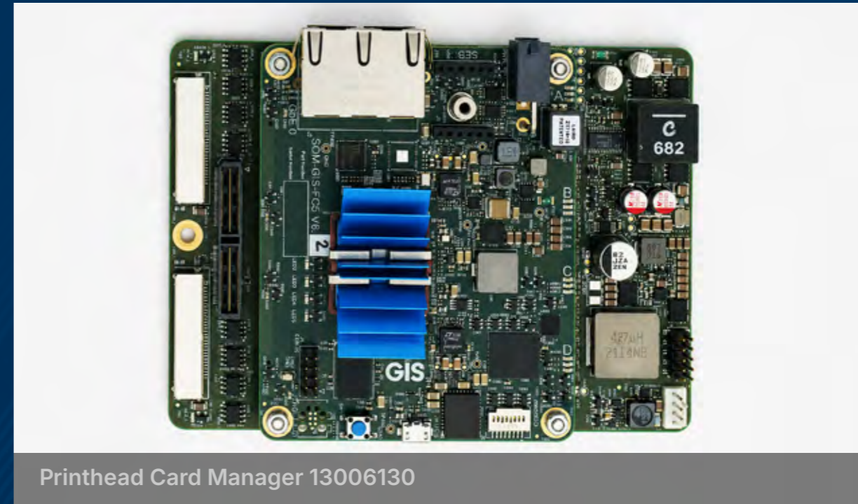
Printhead Card Manager 13006130